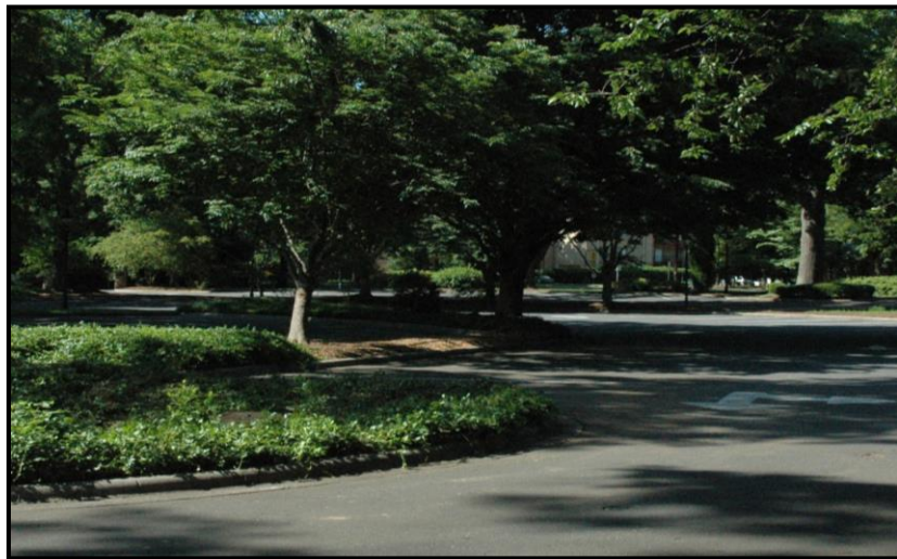
Figure 12.11-2: Example of parking lot broken up by landscaping.

12.11-2 Limitation on Uninterrupted Areas of Parking. Uninterrupted areas of parking lot shall be limited in size. Large parking lots shall be broken by buildings and/or landscape features. See Figure 12.11-2 below: