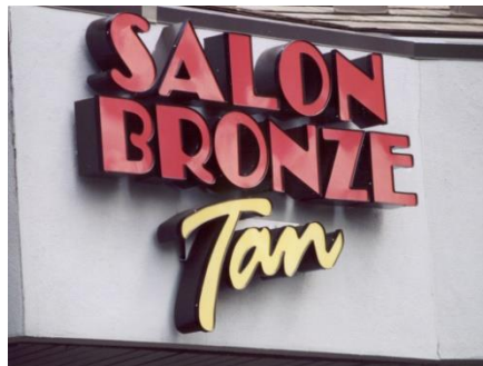
Example of Channel Lettering

CHANNEL LETTERING. A sign design technique involving the installation of three-dimensional lettering against a background, typically a sign face or building façade.