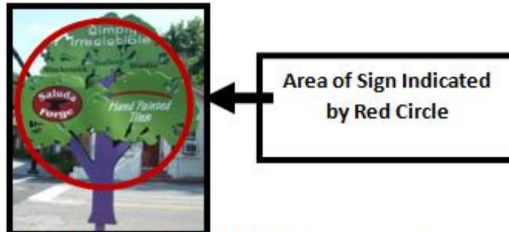
Example Illustrating Measurement of the Area of an Irregularly Shaped Sign

SIGN AREA. The size of a sign in square feet as computed by the area of not more than two standard geometric shapes (specifically circles, squares, rectangles, or triangles) that encompass the shape of the sign exclusive of the supporting structure.